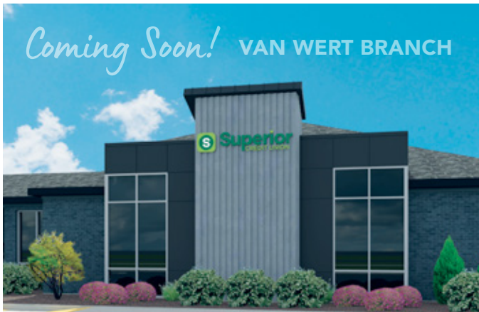
Coming Soon! VAN WERT BRANCH

EXCITING UPDATES FROM YOUR CREDIT UNION.