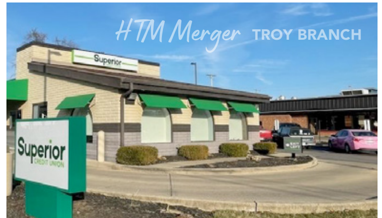
HTM Merger TROY BRANCH

For almost 70 years, Superior has been providing financial services for members. From one branch office to 24, we continue to pride ourselves on superior member service and products suited to your individual needs.